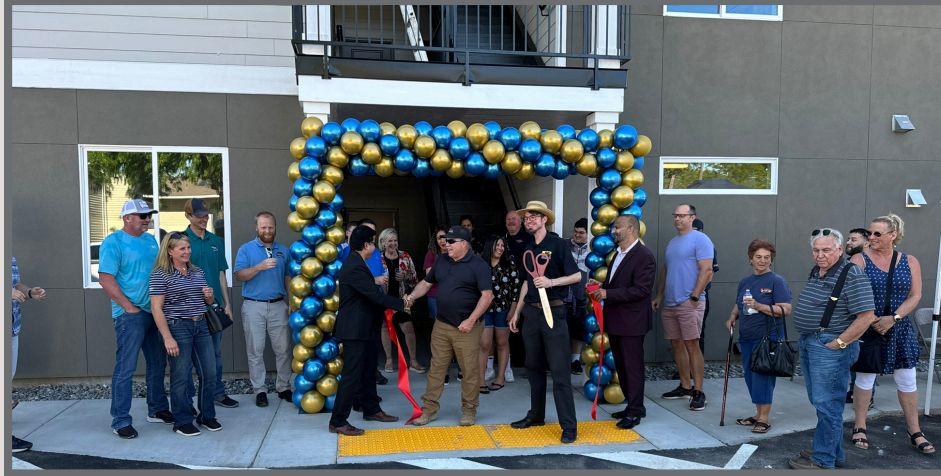
Ribbon-cutting ceremony at the Galaxy Apartments.