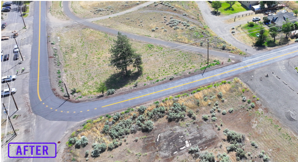
The before and after pictures of 3rd St./Switzler Sealcoat Project.