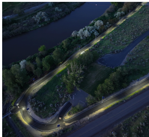
The new solar powered lights on Trail #2 project