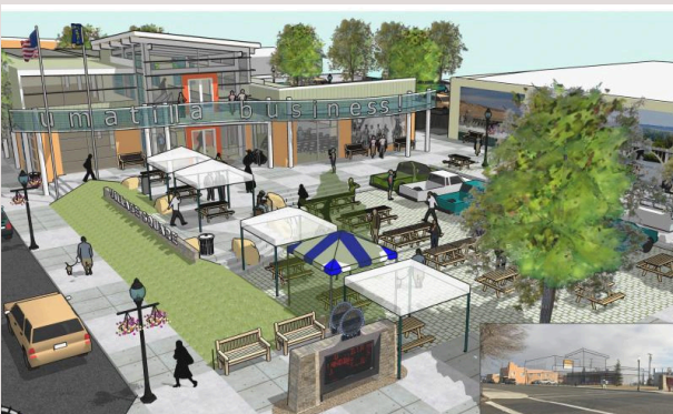
The business center will be located in what is now the old post office.

Business Center Update: The city has now obtained the official approval from The Economic Development Administration to move forward with the project. The staff will soon begin the process of putting the project out for bidding in the upcoming weeks. Upon selecting the contractor, the project will advance to the construction phase, with the groundbreaking ceremony scheduled for later this year.