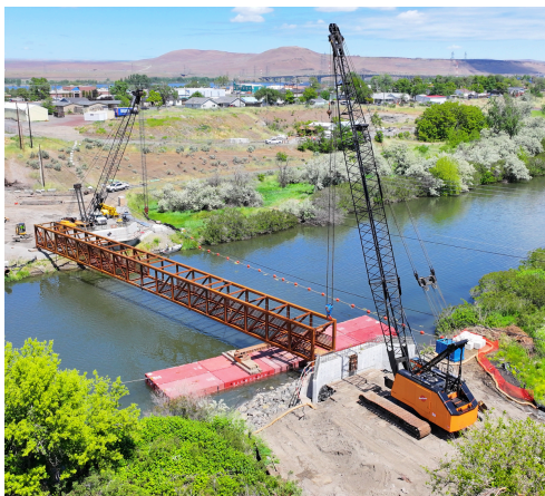
The Pedestrian Bridge atop abutments.

Every project has been meticulously planned and executed to improve community infrastructure and elevate the overall quality of life for residents.